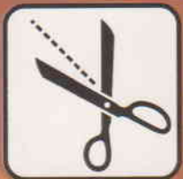
EASY TO CUT