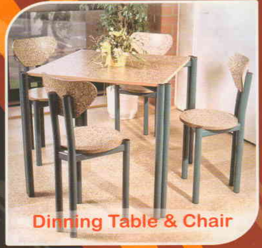
Dinning Table & Chair